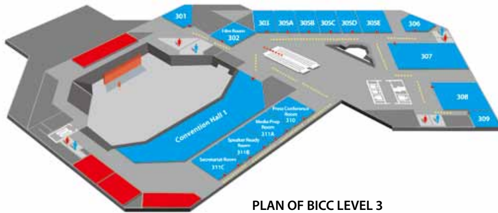
PLAN OF BICC LEVEL 3