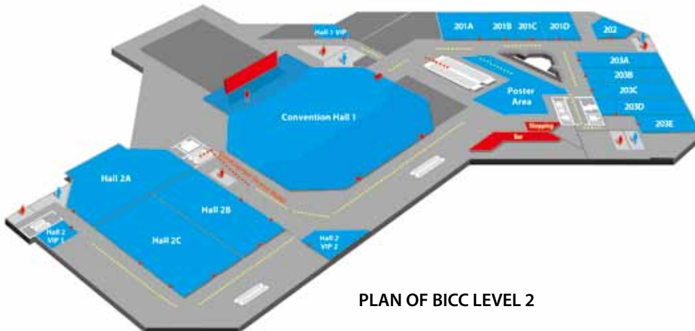
PLAN OF BICC LEVEL 2